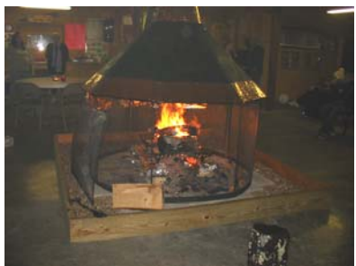
Cliff and Greg have been busy

Above: a fireplace and winterizing of the Barn to make some of the camp available in winter.